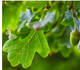
oak tree leaf