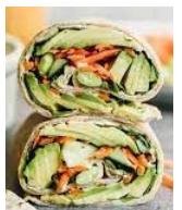
Hummus & salad wrap