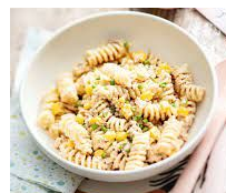
Tuna & Sweetcorn pasta