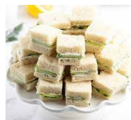
Cream cheese & cucumber sandwich