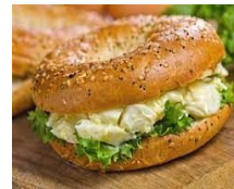
Egg Mayonnaise & lettuce bagel